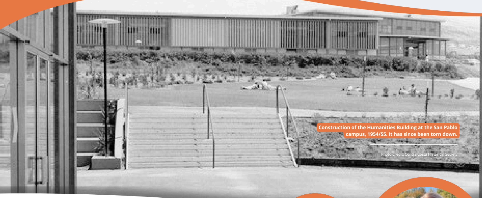
Construction of the Humanities Building at the San Pablo campus, 1954/55. It has since been torn down.